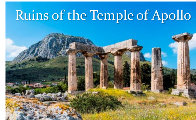
Ruins of the Temple of Apollo

Temple of Apollo, center of same-sex practice with boys, was in Corinth.