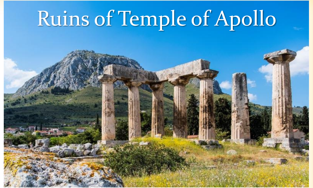
Ruins of Temple of Apollo